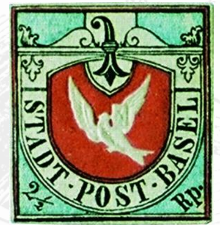
Basel 2½ rappen (first multicolored!) $11,300 in any condition