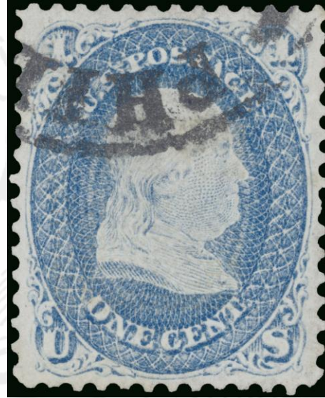
“Benjamin Franklin Z Grill”