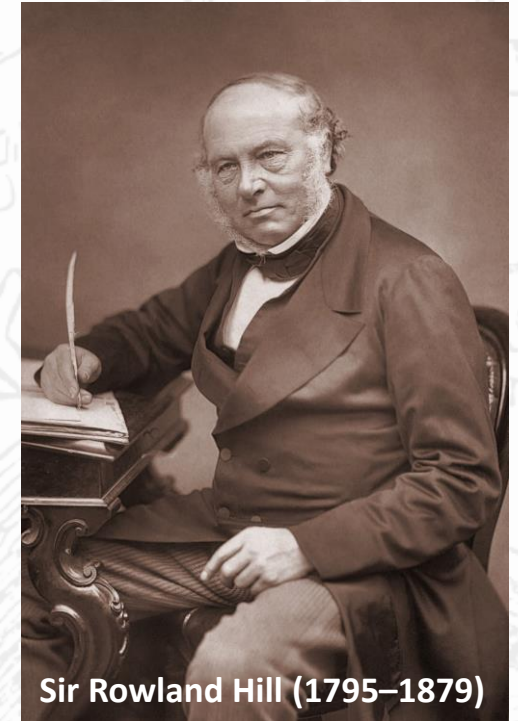
Sir Rowland Hill (1795–1879)

1d black Over 68 million printed $5,800 unused; $225 used