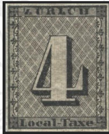
Zürich 4 rappen black $13,500 unused or used