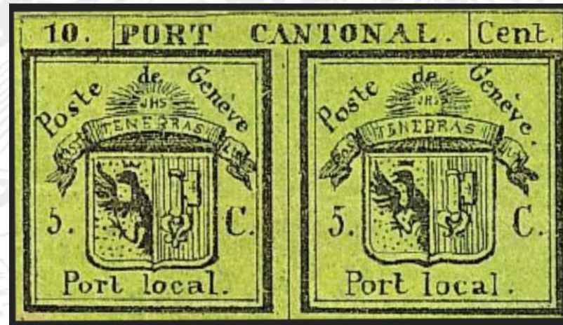
Geneva 5 + 5 cents black on yellow-green paper, aka "Double Geneva" $56,500 unused, $33,800 used