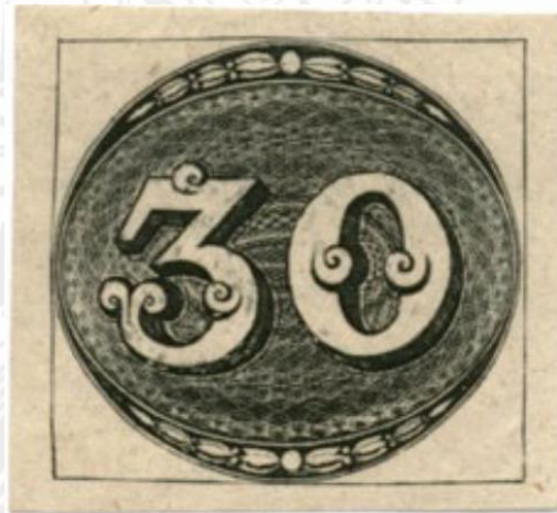
Brazil 30 réis black "Bull's Eye" $3,900 unused $670 used