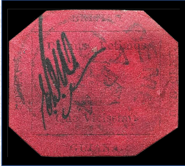
“British Guiana 1c magenta”