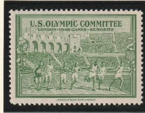
No value, green