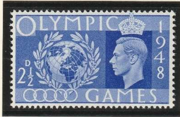
Globe and laurel wreath 2½d ultramarine