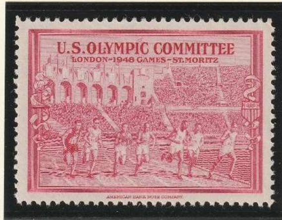
No value, red