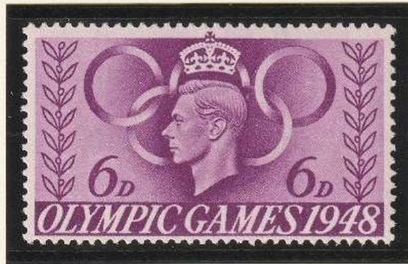
Olympic rings and laurels 6d bright purple