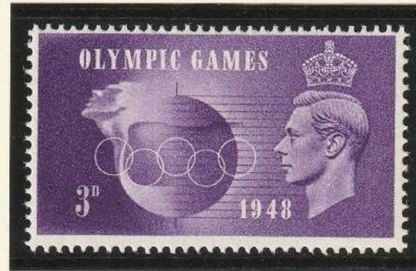
Speed 3d violet