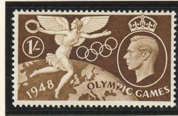
Winged Victory and globe 1/- brown