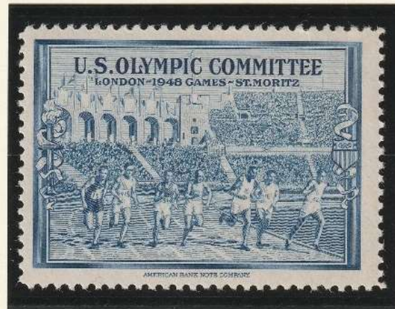
No value, blue