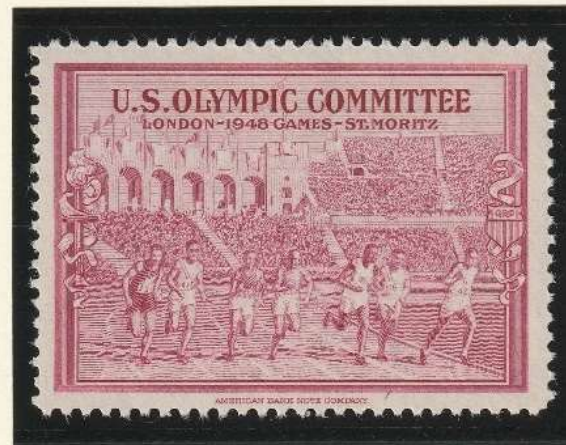
No value, purple